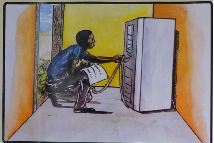
CHECK AND RECORD FAULTS CHECK FAULTS FROM INVERTER & REPORT TO THE TECHNICIAN