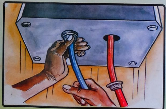
CHECK AND COVER UP ALL HOLES TO AVOID RODENTS AND LIZARDS FROM ENTERING THE INVERTER