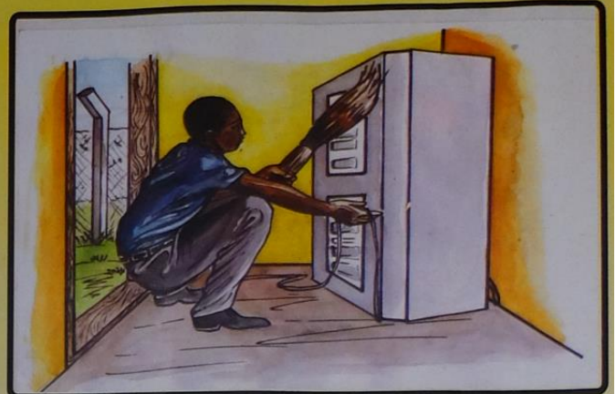
REGULAR CLEANING OF INVERTER CLEAN DUST USING A DRY CLOTH AND BROOM