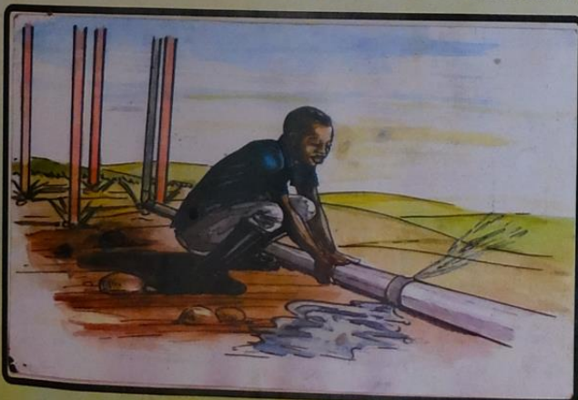
INSPECT WATER PIPING SYSTEM REPORT LEAKAGES TO A PLUMBER TO TIGHTEN ALL LOOSE SECTIONS